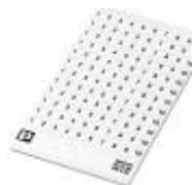
Marker card, Card, white, labeled, Horizontal: Consecutive numbers 1 - 10, 11 - 20, etc. up to 91 - (99)100, Mounting type: Adhesive, for terminal block width: 5 mm, Lettering field: 5 x 3.8 mm

Marker card - SK 5/3,8:FORTL.ZAHLEN - 0804183